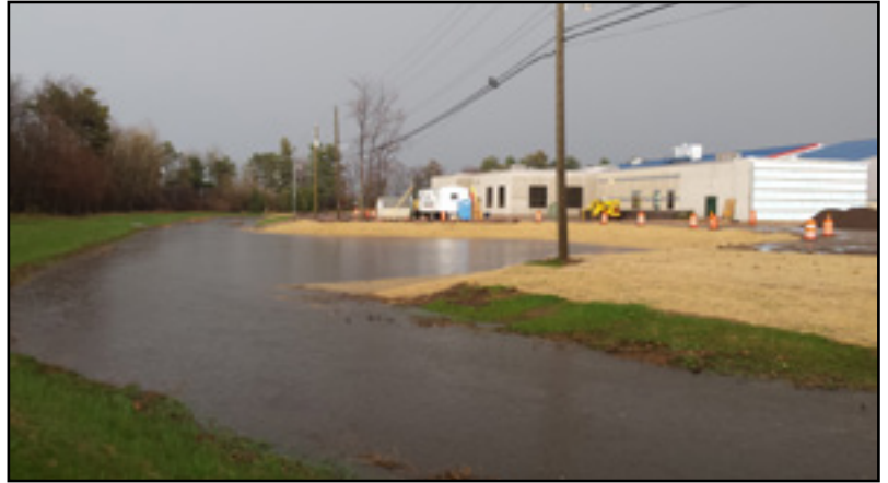
Work will be continuing throughout the summer to improve stormwater management near Lakeview Arena.

The project has resulted in the widening of the ditch that drains to the lake, and various species of native plants will be planted throughout the summer. Additionally, the plan includes the installation of special pavement in the Lakeview Arena parking lot, which will help to filter the stormwater and to slow the overall flow of water into Superior.