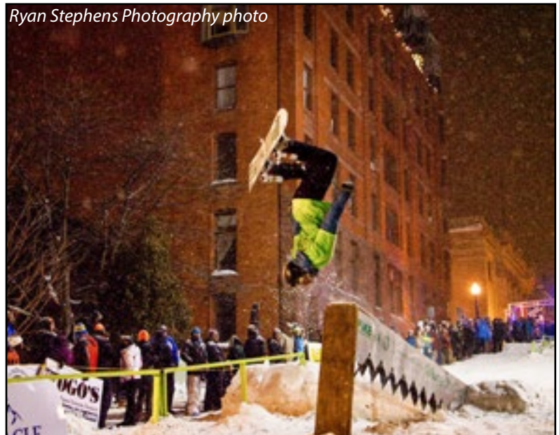
The annual Downtown Showdown Rail Jam is slated for Feb. 21, 2015.