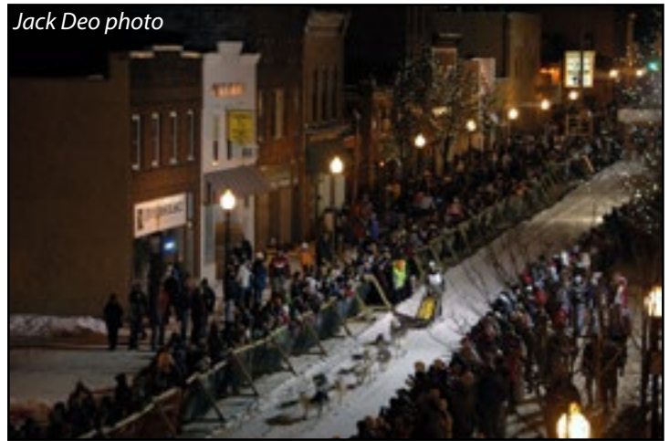
The UP200 draws large crowds to downtown Marquette.

Saturday morning, the Kiddie Mutt Races, sponsored by the Marquette Kiwanis, begin at 11 a.m. at the Marquette Commons. Catch the fun as family dogs try to qualify as a "sled dog." Also on Saturday, Gwinn will host the 12th running of the Jack Pine 30, a 30-mile race offering competition for six-dog teams beginning at 9:30 a.m.