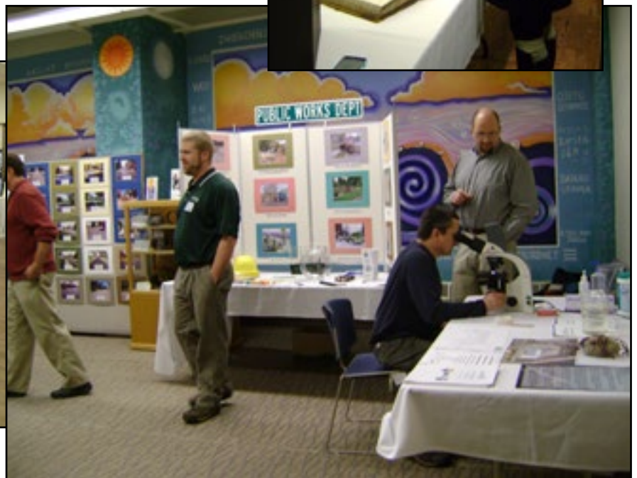
The 2014 City of Marquette Open House was a success, with more than 200 individuals in attendance.