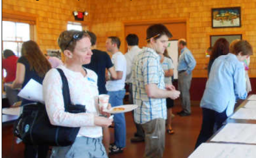
Visioning workshop at the Marquette Commons, June 4, 2012

The Marquette City Planning Commission and City of Marquette Community Development Department staff have recently launched a collaborative effort between the community and City staff to update the Community Master Plan and are calling the project "A Vision for Marquette." A new webpage, www.mqtcty.org/vision , will provide public access to various tools and resources for easy and effective participation in the planning process. Resources are also available to the public at the Planning Department office in City Hall.