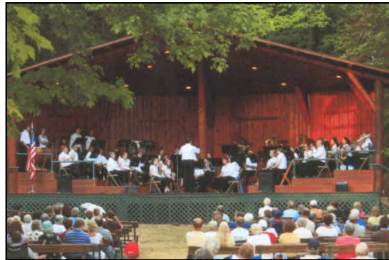
Above, photo of the Marquette City Band performing at Presque Isle Park's Band Shell, the venue for most of their concerts.