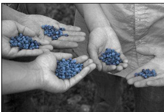
Above: Winning image for 2012 festival poster.

Plans are underway for the 11 th Annual Blueberry Festival to be held Friday, July 27, 2012 from 11:00 a.m. to 7:00 p.m. on Washington and Front Streets, Downtown Marquette. The streets will be bustling as local businesses offer sidewalk sales and "blue" specials along with crafters and performers. Pony rides, arcade jumps and children's activities will delight the youngsters. Mounds of fresh plump blueberries are always a feature and downtown restaurants will satisfy cravings for blueberry fare with creative offerings from blueberry pizza to blueberry beer.