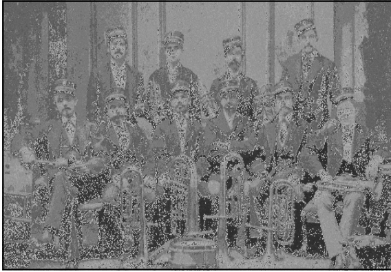
Above