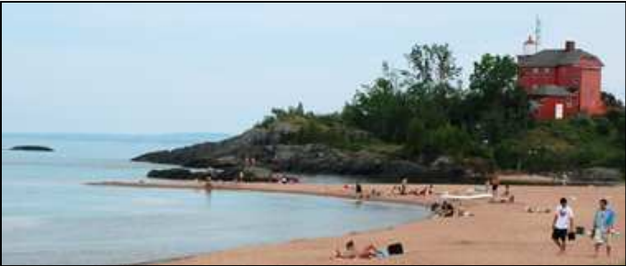
McCarty’s Cove, pictured above, is one of two designated swimming beaches within the City of Marquette. The other approved beach is South Beach, located on Lake Street. Both of these beaches are highlighted in green on the City of Marquette Waterfront Access Codes Map, above.