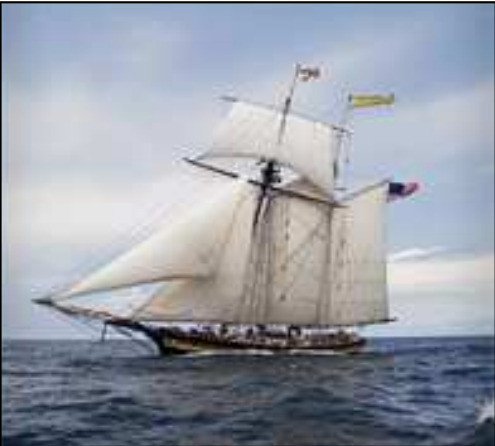
Pride of Baltimore II