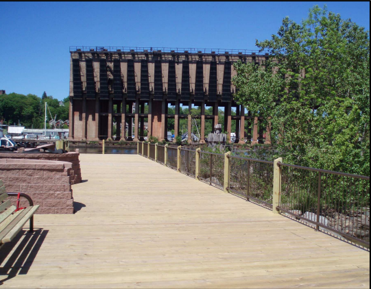
A view of the boardwalk looking toward the Ore Dock is pictured above. The pedestrian railing, park benches, and elevated block planters are in place.