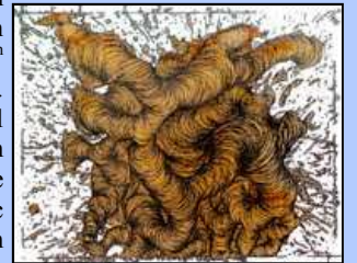
"Environments," by Joe Sobel

'What's in a Name?' will be on display at the City of Marquette Arts and Culture Center's Lower Level Gallery from July 6 - July 30, with a public reception held for the artists in the gallery on Thursday, July 7 th from 6:00 - 8:00 p.m. The Lower Level Gallery is located in the lower level of the Peter White Public Library, at 217 North Front Street.