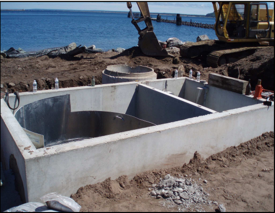
The storm water treatment unit is pictured above. This structure will treat the storm water before entering Lake Superior by the use of vortex technology and sediment deposition. The Vortex system removes finer sediment, particles, free oil, and debris (such as trash) from urban runoff.

The Founders Landing Boardwalk and Sea Wall project is in progress and starting to take on the characteristics of the final product. The boardwalk is expected to be complete and open to the public in August. Part of the project is detailed below.