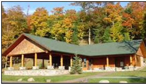
Presque Isle Pavilion, pictured above, located at Presque Isle Park, is a popular rental facility.

Left, a community garden member tends to her garden plot at the Presque Isle Community Garden space. In its eighth year of operation, the Community Garden is planting strong roots within the City of Marquette!