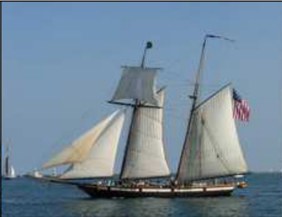
Lynx America's Privateer