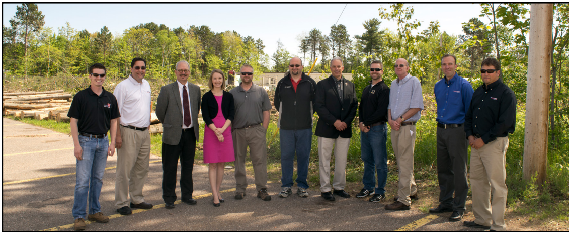
Municipal Service Center Design-Build Team with the City Project Team

It's already been more than a year-long process to get to the point of groundbreaking on the site of the new Municipal Service Center for Public Works operations. The move was due to an agreement with the local hospital, Duke LifePoint (DLP), in which they purchased 37 acres of City property – the property that housed the City's Municipal Service Center as well as the adjacent "roundhouse" property.