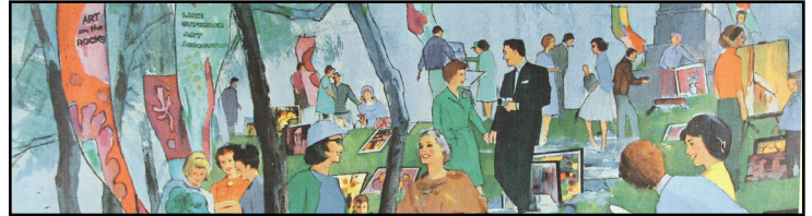
Edited from "Art on the Rocks located at the Father Marquette statue, 1960 TIME Magazine"

Reunion, vacations and other events are scheduled to ensure that a visit to Art on the Rocks can be the focal point of a trip to the Upper Peninsula, specifically Marquette in late July. This celebration of art and talent has been an important component every summer for a half a century for those who live in or visit this area.