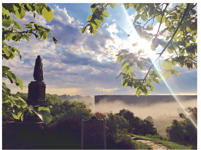
Statue of Father Marquette.

The full Public Art Policy and applications for the Public Art Commission are available at <u>www.marquettemi</u>. <u>gov/public-art-commission/</u>. Applications are also available in the City Manager's Office located at 300 W. Baraga Ave. The City Commission will begin reviewing applications starting in December to begin the selection process; however, applications will be accepted on an ongoing basis. Please call 906-228-0472 or email <u>artsculture@marquettemi.gov</u> for more information.