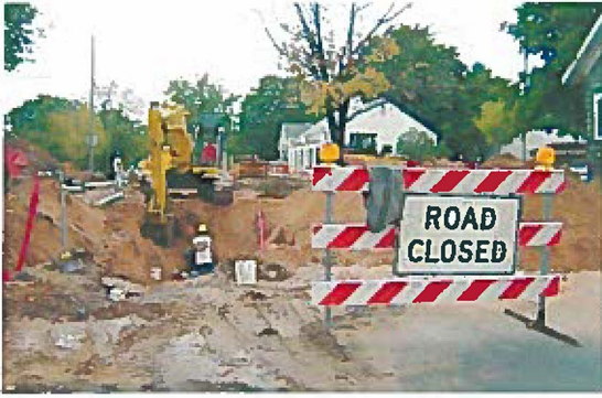
Typical street reconstruction site.